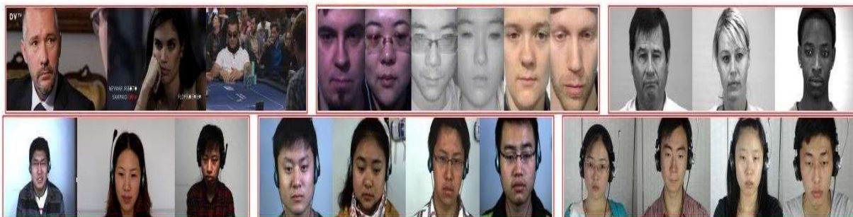
Fig. 2: Snapshots of six micro-expression datasets. From left to right and from top to bottom, these are as follows: MEVIEW [28], SAMM [29], SMIC [30], CASME [31], CASME II [32], and CAS(ME)2 [33].