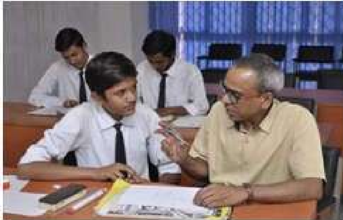
Figure 2. Student Centred Strategy